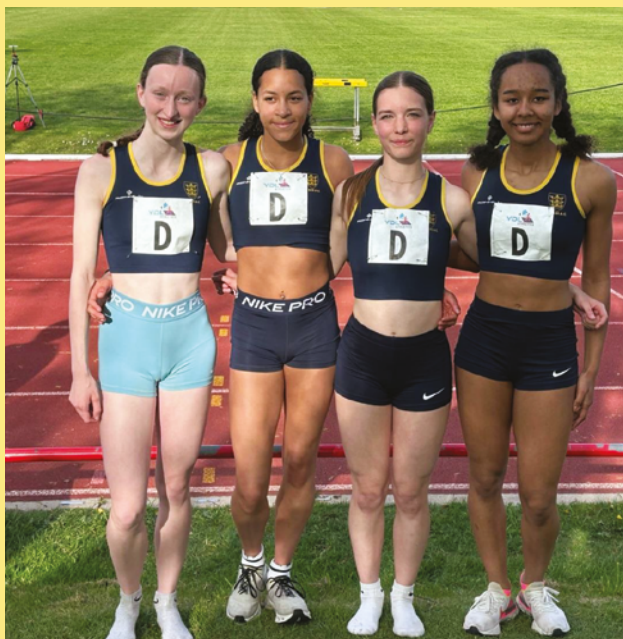
Record Breaking U17W 4 x 300m Relay Team